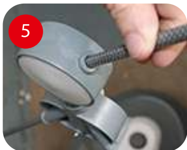
5. Insert tensioning rods into top holes.