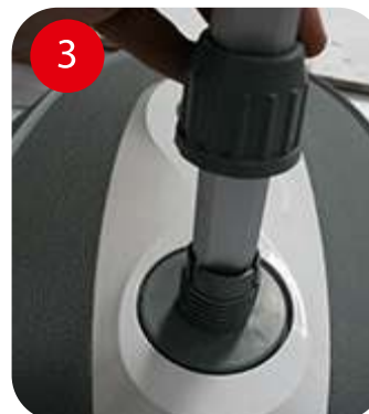
3. Insert pole into locator, and tighten top nut. Fill base with required water through filling hole.