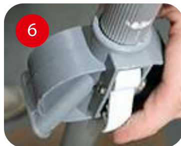
6. extend pole to required height ensuring it is locked into a groove.