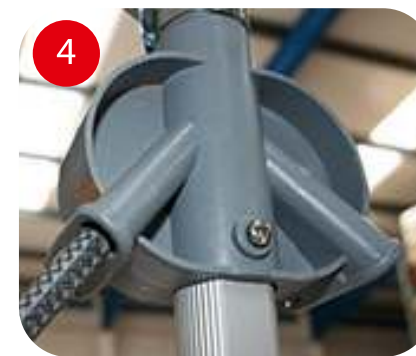
4. Insert tensioning rods into front bottom holes.