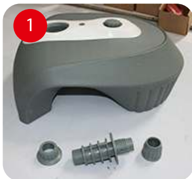
1. Base components, remove all plastic nuts from pole locator.