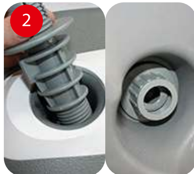
2. Insert pole locator and fasten bottom nut.